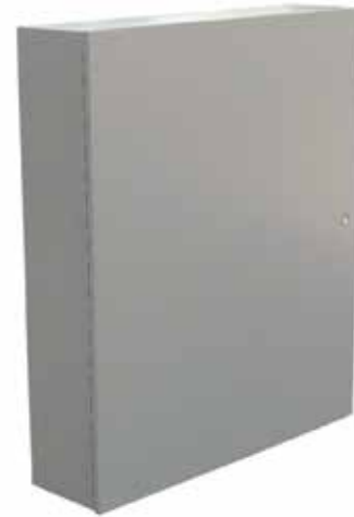
Nema 1 Large